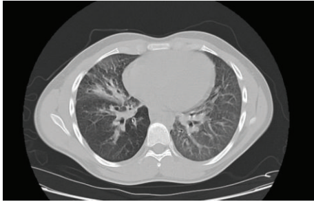
FIGURE 1: CT scan of the chest showing central bronchiectasis.

sinuses. The pulmonary function test showed predominantly obstruction of the small airways with no improvement after albuterol administration. A marked decrease in the diffusion capacity of the lung with a restrictive pattern was also noted. Further tests were ordered to explore the possibility of a multisystem disease and semen analysis showed a marked absence in motility of the sperm, thereby explaining PCD to be the probable cause of all his symptoms.