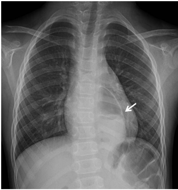
Figure 1. Chest radiograph image of a 6 year-old child who recently developed recurrent vomiting. A 7 × 3 cm sized oval mass-like lesion with internal air-fluid level is located in the posterior paravertebral region (arrow).

bowel loop. Our first radiological impression was a type I congenital cystic adenomatoid malformation because of its internal unilocular air density, or a variation of Bochdalek hernia because of its location and characteristic inner-wall enhancement. Endoscopy was performed to look for a communication between the mass and esophagus, but none was found.