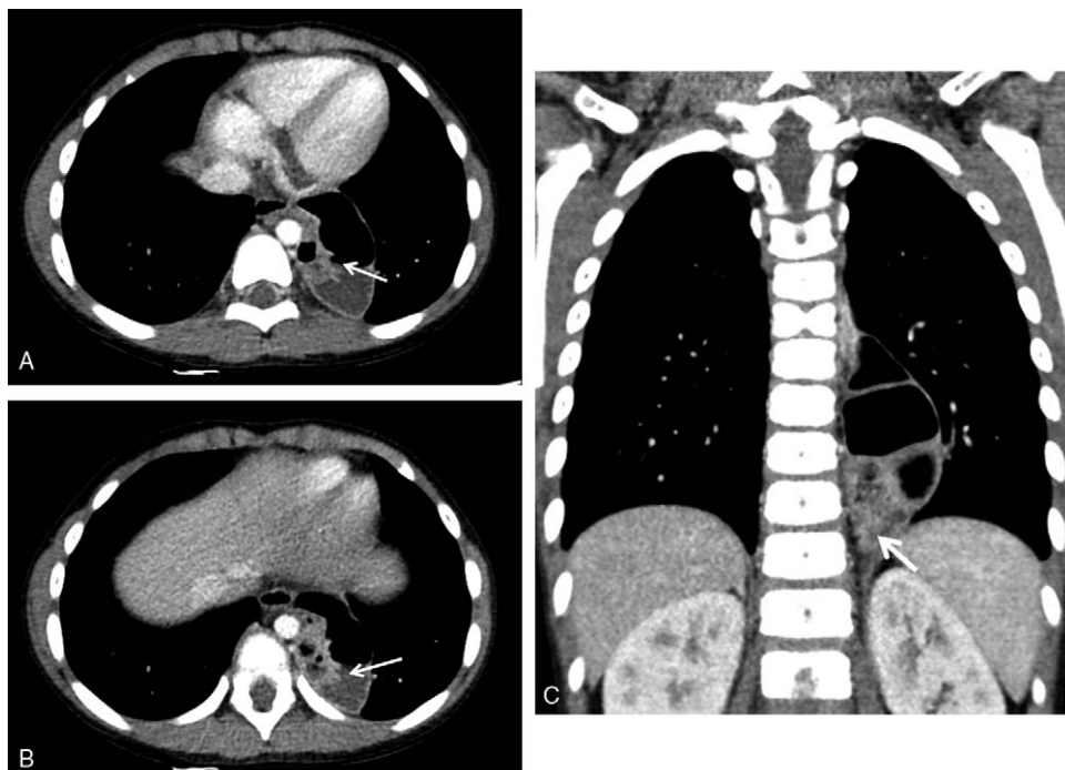
Figure 2. Computed tomography images (A, B) axial, (C) coronal planes of a mediastinal cyst in a 6 year-old child. Note that the cyst with its inner circular fold and double-layered enhancement suggests a bowel-like cystic lesion (arrows).

The patient underwent video-assisted thoracoscopic surgery. The cystic mass was located between the aorta and heart, measured 9 cm in length and 5.5 cm in diameter, and had a smooth, bowel-like outer surface and inner circular folds that looked like valvulae conniventes. No definite connection was found between the mass and any intrathoracic organ. The inferior end of the cystic lesion was not found at surgery, so we could not confirm communication with the abdominal cavity. Histopathological examination of the tissue confirmed an enteric duplication cyst (Fig. 3). The patient was doing well at follow-up with no