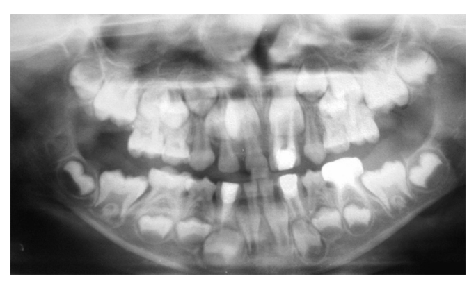
Fig. 6: Follow-up OPG taken one year later revealed significant delay in resorption of deciduous teeth

Patients with this syndrome have a striking depression of acute inflammation, as evidenced by cold abscesses despite pronounced local infection, as seen in the present case, i.e. right submandibular salivary gland abscess.