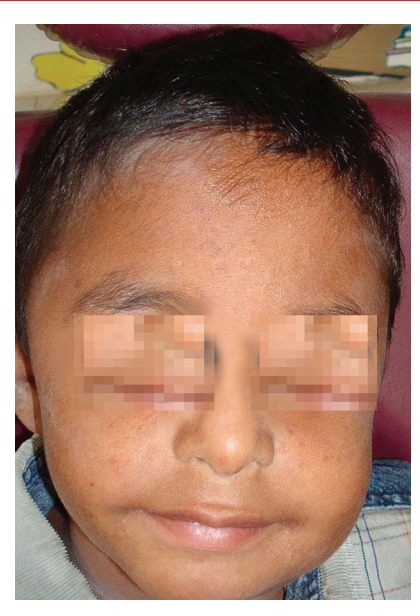
Fig. 1: A 6-year-old male patient showing swelling on the left side of the face