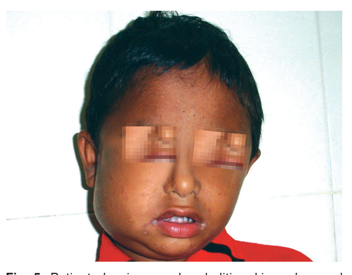
Fig. 5: Patient showing angular chelitis, skin rashes and swelling in the right lower third of the face, on subsequent visit