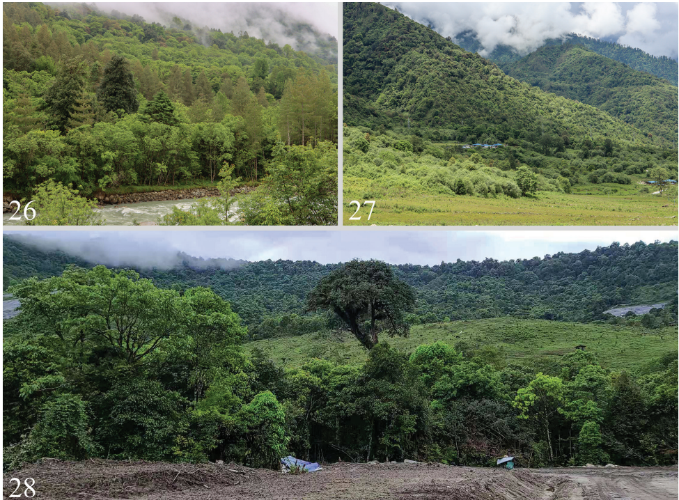
Figures 26–28. Biotopes: China, SE Xizang, Linzhi (= Nyingchi) City, Motuo (= Medog) County 26, 27 Gedang countryside, two different collecting sites of S. medogensis sp. nov., photograph by J. Wu 28 Beibeng Countryside, Dergong Village, biotope of S. undulophallus sp. nov., photograph by HL. Han.

Diagnosis. The nominate subspecies cannot be distinguished from S. brevisunca yunnanensis Wu & Fang, 2009 (Fig. 6) externally but the morphology of male genitalia is diagnostic. In the male genitalia, the left process of juxta is long and the right process is finger-shaped apically in S. brevisunca brevisunca (Figs 17, 18), whereas the left process of juxta is short and the right process is blunt apically, without the finger-shaped apex in S. brevisunca yunnanensis (Fig. 15).