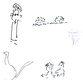
Figure 1 Examples of visual hallucinations drawn by different patients.

Table 1 shows demographic data of all included patients with CBS (n=34) compared with the entire population (n=390). Of the 34 patients with CBS, 28 were female and 6 were male, respectively. Mean age was 79.3 years with a