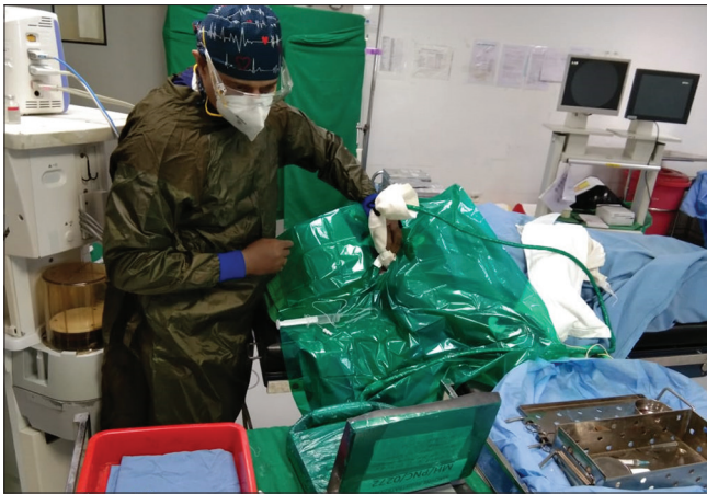
Figure 2: Illustrates a block in progress; Note the equipment preparations

induction technique that reduces aerosol generation to the minimum [13]