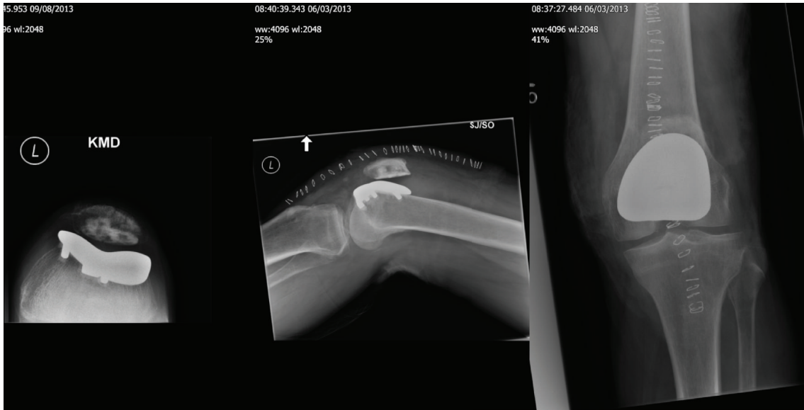
FIGURE 1: Postoperative radiograph of patellofemoral joint replacement.