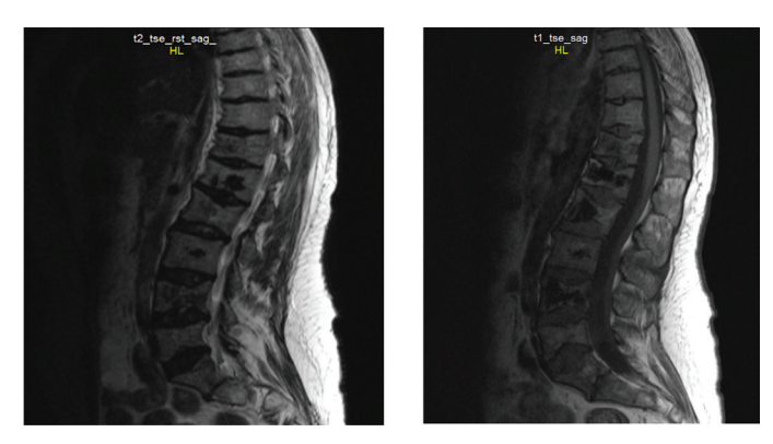
Figure 1. Magnetic resonance imaging shows multiple infarcts involving vertebral column T2 and T1 sagittal images. Non-enhancing areas involving vertebral bodies at dorsal and lumbar levels suggest infarcts.

SCS has become popular in recent years. It is a neuromodulator and manages cases of certain chronic pain for which other procedures have failed, including failed back syndrome [1], ischemic limb pain [2], angina pectoris [3], and painful peripheral