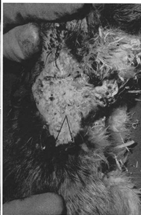
(Dalmat: Arthropod transmission of papillomatosis)