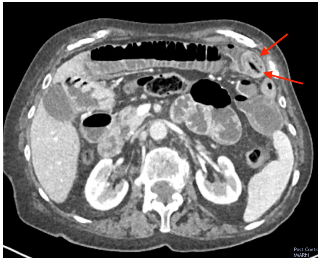
FIGURE 3: Axial CT image showing an obstructing enterolith (arrows) that has likely migrated from its original location in the inflamed jejunal diverticulum (see Figure 1) and now appears lodged in a loop of mid-small bowel.