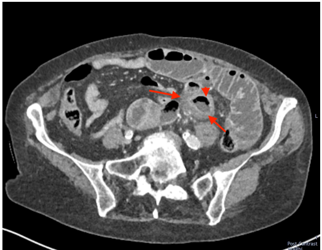
FIGURE 1: Axial CT image of an inflamed jejunal diverticulum (arrowhead). This is likely to be the originating site of the obstructing enterolith. The arrows highlight features of acute inflammation with wall thickening and surrounding mesenteric inflammatory stranding.