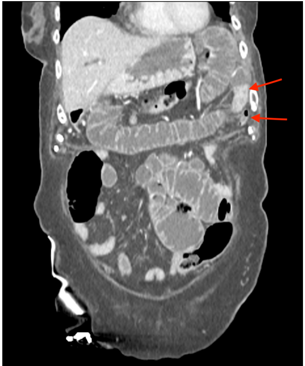
FIGURE 4: Coronal CT image showing the enterolith causing a high-grade mechanical bowel obstruction. This image demonstrates collapsed small bowel distal to the transition point (arrows).

The enterolith was milked proximally and removed via a transverse enterotomy (Figure 5). The gallbladder was thin walled with no palpable gallstones or fistulae. However, several jejunal diverticula were noted, one of which appeared to be inflamed. Following surgery, the patient returned to the ward for analgesia and supportive care. She recovered well and was discharged seven days following admission.