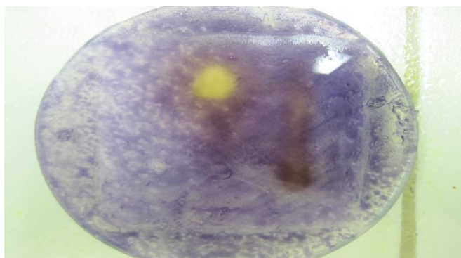
Figure 2. TLC result of D. dao stem bark extracts on MSSA with MTT

Note: colorless bands show secondary metabolites that inhibited the growth of MRSA; TLC = thin layer chromatography, MH = Mueller-Hinton, MTT = 3-(4,5-dimethylthiazole-2-yl)-2,5-diphenyltetrazolium bromide, MRSA = Methicillin-resistant Staphylococcus aureus