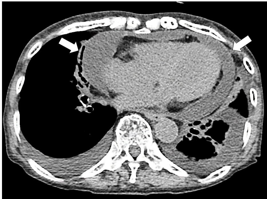
FIGURE 2: Pericardial effusion on the initial CT (arrows)