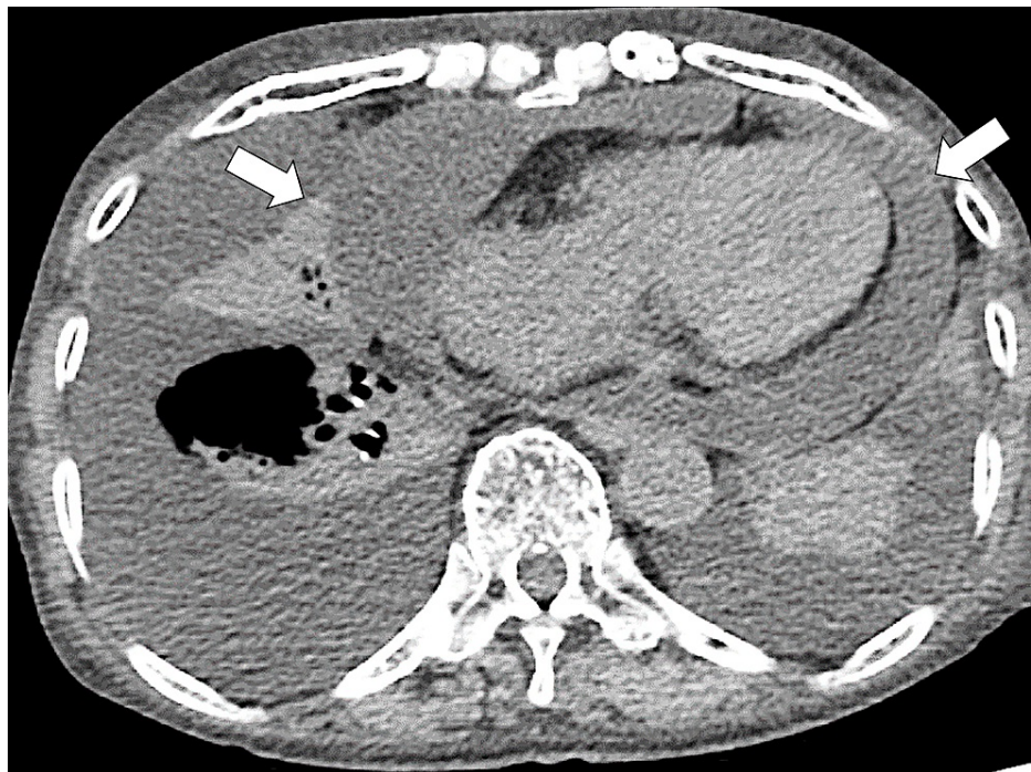
FIGURE 3: Cardiac tamponade on the subsequent CT (arrows)

Based on the clinical presentation and imaging and laboratory data, the patient was diagnosed with acute pericarditis and treated with colchicine (1.2 mg/day) and diclofenac (75 mg/day). On the sixth day of admission, systemic edema and dyspnea worsened, and a decrease in urine volume was observed even with the intravenous use of furosemide (60 mg/day). A follow-up CT showed an increase in pericardial effusion and compression of the heart (Figure 3).