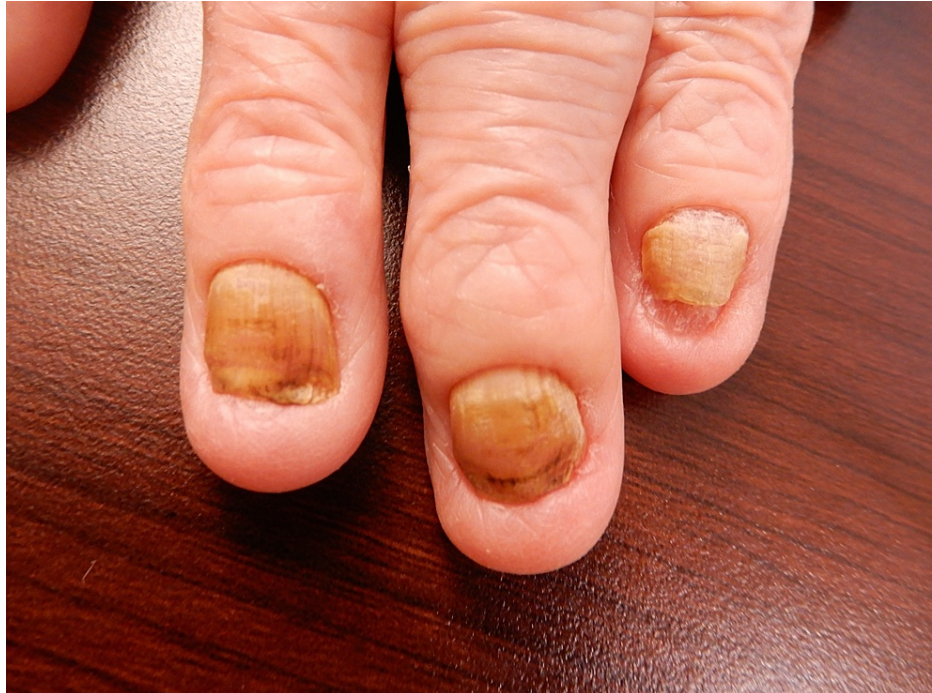
FIGURE 1: Yellow nails on the fingers of the patient

An independent 82-year-old woman presented to our hospital with chief complaints of bilateral leg edema three months prior to the admission. She had severe proteinemia, chronic bronchitis, bilateral pleural effusion, and yellow nails (Figure 1).