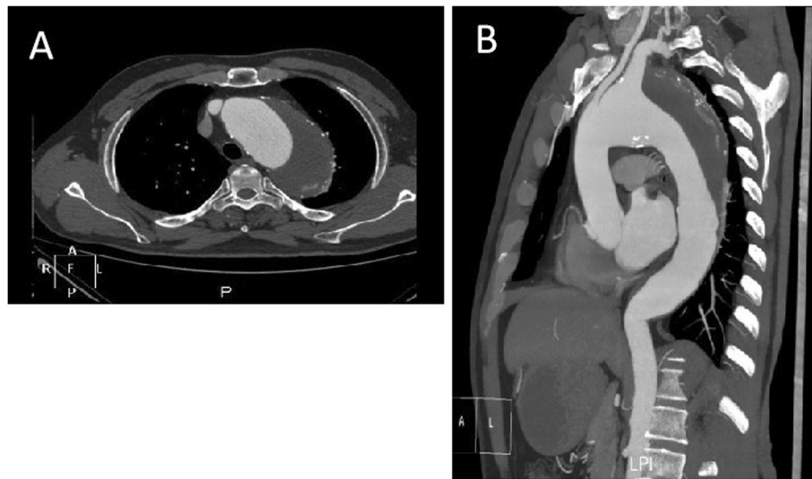
Fig. 1 a, b: Preoperative CTA

Ltd., Shanghai, China) (Fig. 2a) was inserted into the descending aorta. The proximal stent-free vascular graft was then retracted back into the aortic arch. Running 4–0 Prolene sutures were made between the prosthesis and normal tissue of the aortic arch distal to the LCCA ostium (Fig. 2b), which attached the vascular graft with the aortic arch. The incision of the aortic arch was then closed with 4–0 Prolene sutures. This completed the aortic arch repair (Fig. 3). Then CPB was gradually resumed and rewarming was started. An 8 mm prosthetic vascular graft was placed from the ascending aorta to the left axillary artery to reconstruct the left subclavian artery. Afterwards, a guidewire and a 6-French short sheath were introduced through the right femoral artery. The covered stent-graft (Valiant Captivia VAM3232 C200TE Medtronic, Inc., Minneapolis, Minnesota, USA) was advanced into the previously inserted stent-graft, which fully excluded the descending aneurysm. The rest of surgery was completed routinely. The durations for