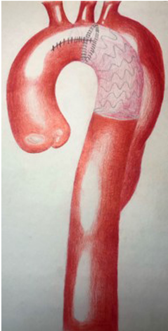
Fig. 3 The treatment of the aortic arch was completed

of serious complications. Patients with multiple comorbidities may experience significant morbidity and mortality from both neurologic and cardiovascular complications [4].