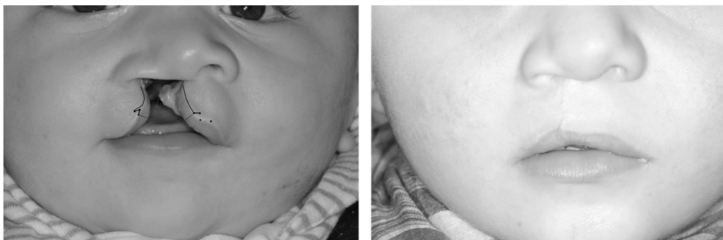
Figure 2. To show the lip markings with reference to Randall's technique [13].

The lip markings of Randall's "triangular flap" technique are shown in Figure 2.