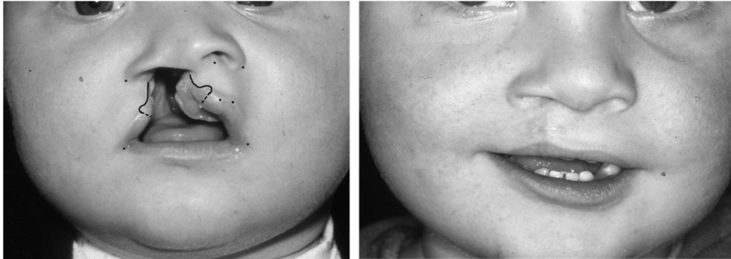
Figure 1. Indicating the lip markings according to Pfeifer's technique [9].

The lip markings of Pfeifer's "wave-line" technique are illustrated in Figure 1.