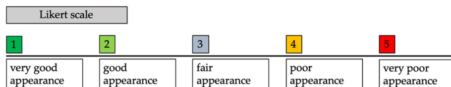
Figure 5. To display the Likert scale used for assessment of the cropped photographs.

Five professionals experienced in cleft care (three oral and maxillofacial surgeons, one speech and language therapist, and one orthodontist), employed in our service scored the cropped photographs. The assessors were blinded to the patients’ identities. The two surgeons who had performed the procedures were not among the raters.