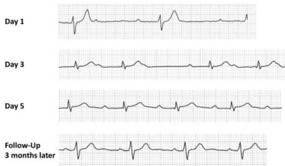
Figure 2 The electrocardiographic progression of a patient with Lyme carditis presenting with third-degree atrioventricular block under antibiotic treatment.

Serologic testing for Lyme disease consists of an initial borrelia antibody (IgG/IgM) screening test. Positive results must be confirmed by western blot assay. In addition, it is necessary to exclude a current Syphilis disease, because it can interfere with the borrelia antibody test.