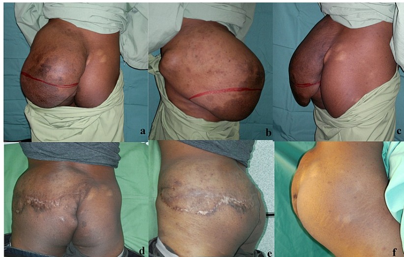
FIGURE 2: Initial presentation with different views: posterior view, left lateral view, and right lateral view (a-c). Post serial excision photos taken in different views: posterior view, lateral view, and medial view (d-f).