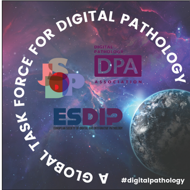
Figure 1: DPA–ESDIP–JSDP task force for worldwide adoption of digital pathology

research and routine settings ( https://digitalpathologysociety.org/ ). It was founded in 2016, having its roots in the fields of telepathology and virtual microscopy back to 1992. ESDIP's annual meeting, the European Congress on Digital Pathology (ECDP), hosts individual and joint meetings of IHE PaLM WG and DICOM WG-26 to support standardization of systems ( https://www.ecdp2021.org/ ). The JSDP is a leading professional society of digital pathology in the Asia-Pacific region with almost 20 years of history of contribution to the field of telepathology, and more recently, AI ( https://www.jsdp.ai/index.php/jsdp2021/?lang=en ). JSDP organizes an annual meeting every summer, to which are added other educational and research events throughout the year. The number of active members of JSDP is approaching 200, including pathologists, computer scientists, medical technicians, students, health administrators, and industry representatives. JSDP serves as a key hub for disseminating knowledge about digital pathology in Asia.