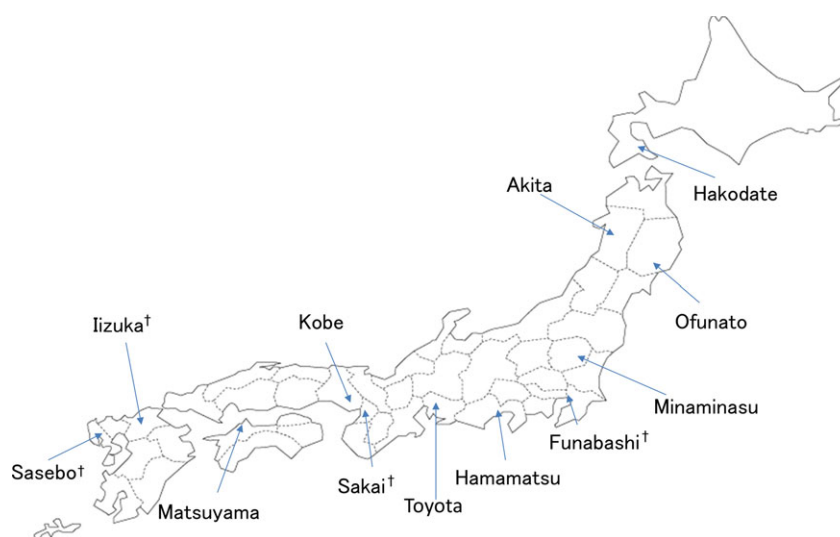
Fig. 1. Study sites to evaluate the effectiveness of dispatcher training in increasing bystander chest compression for out-of-hospital cardiac arrest patients in Japan, selected by population size. †Excluded from study.

As this was a secondary data analysis, the number of patients was determined in advance. Thus, we calculated power based on the given sample size to indicate the appropriateness of the size, rather than calculating required size. A total of 249 and 283 OHCA patients were included in the analysis before and after the training, respectively. Assuming that appropriate chest compressions implementation rates would be 20% before education, and that this would