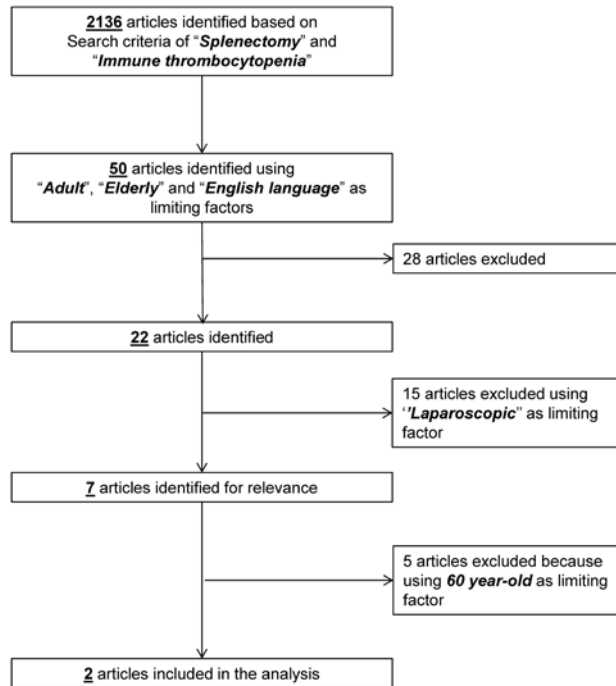
Figure 2: Flow diagram of search strategy

diseases (mostly cardiovascular diseases or diabetes) as in Park et al. Patients underwent splenectomy after a median time from diagnosis of 35.5 months (varying from 0 to 146 months) and a median number of prior treatments of 2 (range, 1 to more than 3). Pneumococcal vaccination was performed in 89.9% of patients ( n=98 ) at least two weeks before surgery. The median preoperative platelet count was 51.5 \times 10^9/L (range, 2 – 347 \times 10^9/L ).