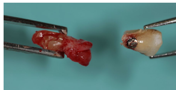
Fig. 4 Photograph of extracted tooth 35 showing in detail the resorptive soft tissue process in the cervical area