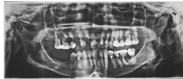
Fig. 1 A panoramic radiograph taken in July 2020 showing generalized external cervical root resorption

A 74-year-old female patient presented in July 2020 with a chief complaint of occasional pain, thermal sensitivity and slightly increased mobility of her left mandibular second premolar (tooth 35). Her symptoms started two months ago. She also reported unexpected fractures of otherwise asymptomatic teeth in the previous weeks.