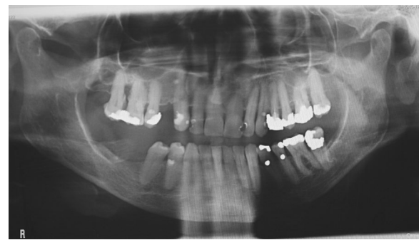
Fig. 2 A panoramic radiograph taken in September 2017 with no signs of external cervical root resorption

Four weeks prior to the first examination, a crown of the first left mandibular incisor (tooth 31) suddenly broke. Two weeks later, in a similar manner, she lost a crown of the second maxillary right incisor (tooth 12) because of the fracture in the cervical area of the tooth caused by chewing. She was referred by her dentist to the Department of Stomatology and Maxillofacial Surgery at University Hospital Martin with numerous sites of external cervical root resorption found on her recent panoramic radiograph (Fig. 1). All roots of her 23 teeth were affected, and crowns of previously broken teeth 12 and 31 were missing. There were no signs of external cervical root resorption on her previous radiographic examination in 2017. However, the panoramic radiograph from 2017 showed signs of Generalized Stage 3 Periodontitis with moderate to severe bone loss around most maxillary and several mandibular teeth. Subgingival calculus was noted on maxillary molars. Bone loss around these teeth was severe and consistent with presence of calculus. Significant bone loss was present around maxillary premolars, between incisors, and between maxillary right canine and lateral incisor. (Fig. 2).