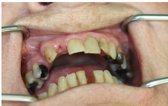
Fig. 3 Intraoral photograph taken in July 2020. Missing crowns of recently broken teeth 12, 31

Because of the pain and mobility of tooth 35, in August 2020, the tooth was extracted under local anesthesia with subsequent suturing of the mucoperiosteal flap to avoid medication-related osteonecrosis of the jaw (MRONJ). The extracted root with cervical resorptive lesion was sent for histological examination (Fig. 4). The healing of the wound was uneventful, and stitches were removed after 14 days. Histological examination of the cervical