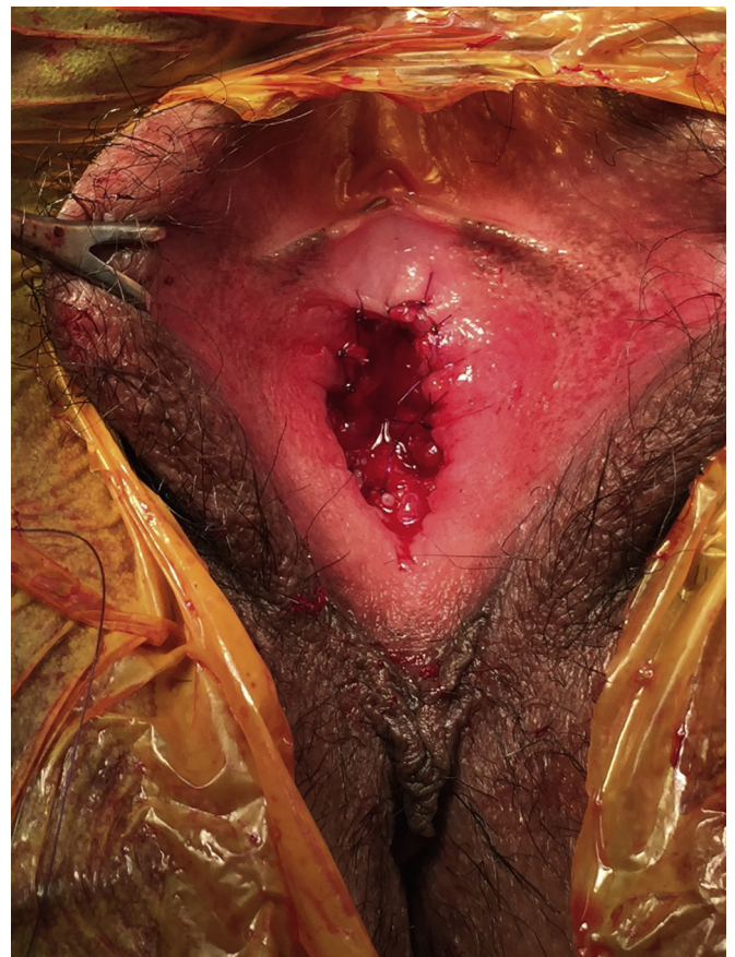
Figure 3. Urethral orifice immediately following resection and reconstruction.

Work-up for periurethral masses includes a detailed history and examination, and if the diagnosis is not clear or is concerning for more complicated pathology, imaging and cystoscopy may be employed. MRI provides superior resolution of the lower urinary tract including diverticuli. Although pelvic ultrasound (trans-abdominal or transvaginal) has limited utility and may overlook distal masses (as occurred in this case), perineal/translabial ultrasound may be useful, with lower cost and faster access. The likelihood of malignancy in any periurethral masses is low, but in the case of solid masses, biopsy may provide additional information to enable appropriate preoperative planning.