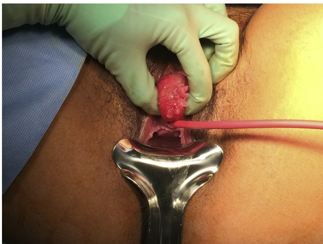
Figure 2. Demonstration of paraurethral mass at time of examination under anesthesia.

Periurethral masses are themselves uncommon, with a retrospective case series finding that they comprise less than 5% of patients being seen at a tertiary, referral urogynecology practice. Urethral and paraurethral leiomyoma make up just 5–7% of periurethral masses. 5 Urethral diverticulum comprise the vast majority of periurethral masses and vaginal cysts are a similar percentage of periurethral masses as urethral leiomyoma. 3,5