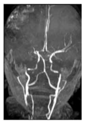
Figure 1. Patient's brain Magnetic Resonance Angiography (MRA) on the second admission

Two years later, she developed slurred speech and paresthesia, and weakness was progressed to her lower extremities. Brain MRI was performed again revealing new acute ischemic infarction in the right temporoparietal lobe. Encephalomalacia with surrounding gliosis was also noted involving the left parieto-occipital lobe because of the old infarction. Complete obstruction of the right MCA from the proximal part was seen in brain MRA. There was also evidence of significant wall irregularity and stenosis in basilar artery, PCA, Anterior Cerebral Artery (ACA), internal carotid arteries, and vertebral arteries. These findings were in favour of moyamoya syndrome (Figure 1). Brain Magnetic Resonance Venography (MRV) was normal. (Figure1).