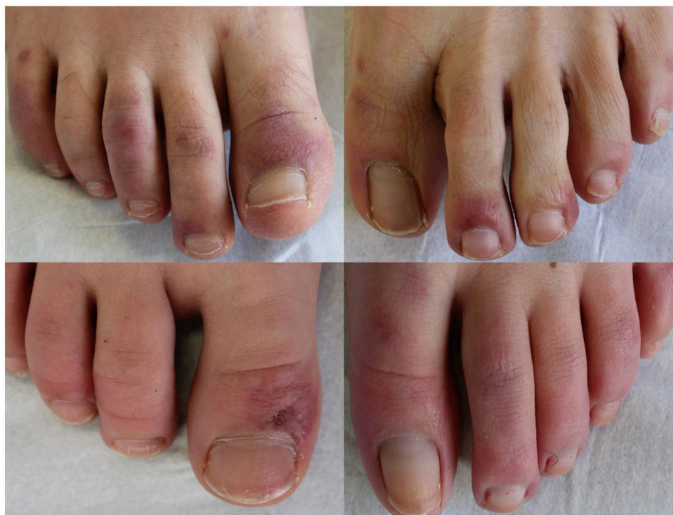
Fig 1. Examples of 4 patients referred for chilblains.

Histology performed in 5 patients showed lymphocytic infiltrate in the superficial dermis around the vessels and eccrine glands in all cases, reminiscent of idiopathic chilblains. Direct immunofluorescence showed fibrinogen and C3 deposits on endothelial cells in 2 cases. Results of indirect immunofluorescence assay using the serum from a