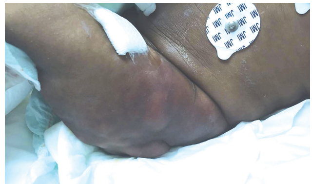
Figure 1 - Erythematous lesions on the buttocks and the lateral portions of the thighs.

seventh day of life, her erythematous lesions increased in size and became more nodular. The nodule was tender and warm on the buttocks, the external side of the thighs, over the dorsum of her back, and on the extensor surface of both arms and shoulders (Figures 1 & 2). These clinical symptoms were associated with normal serum calcium levels of 2.42 mmol/L (normal range: 2.2-2.62 mmol/L) in the context of hypoalbuminemia 27 g/l (normal range: 40.2-47.6 g/l) and high ionized calcium levels of 1.49 mmol/L (normal range: 1.17-1.32 mmol/mL). Other laboratory analyses showed normal alkaline phosphatase level of 261 U/L (normal range: 90-270U/L), hyperphosphatemia 1.96 mmol/L (normal range: 0.8-1.5mmol/L), decreased serum levels of vitamin D 13.47 nmol/L (normal range: 51-75 nmol/L) and appropriately suppressed parathyroid hormone 4.33 pg/mL (normal range: 10-55 pg/mL). Also an elevated urinary calcium (mg/dL): urinary creatinine (mg/dL) ratio of 500 (in mg/dL:mg/dL) (normal range: 15-20) was reported. The thyroid hormone level (TSH): 3.03 ul/l (N) (normal