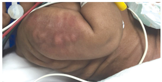
Figure 2 - Erythematous lesions were observed on the extensor surface of both arms and shoulders.

Disclosure. Authors have no conflict of interests, and the work was not supported or funded by any drug company.