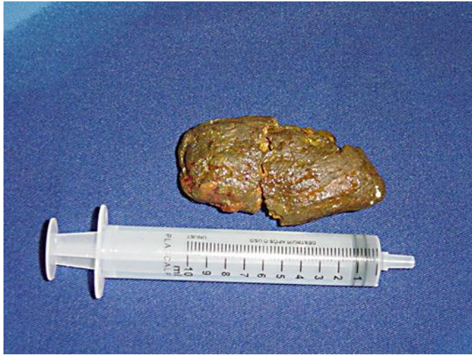
Fig. 2. Brownish diospyrobezoar divided into two parts, measuring 12 × 5 cm and weighing 40 g, removed from the distal ileum through a 15 cm enterectomy that included the site of ileal perforation.