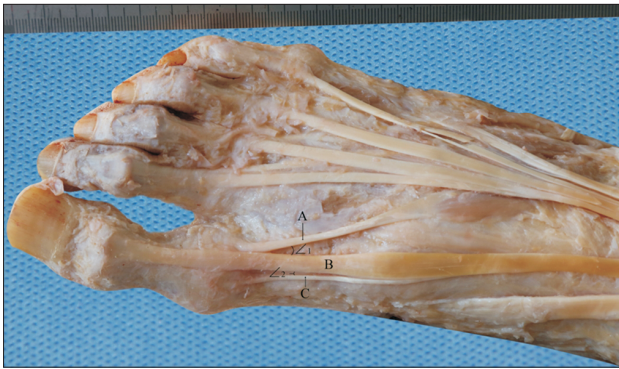
Fig. 1. Morphological structure of type I accessory tendon (AT) of the extensor hallucis longus (EHL). The AT runs on the medial side of the main tendon and inserts onto the dorsal base of the proximal aspect of the proximal phalanx. A: extensor hallucis brevis, B: EHL, C: AT of the EHL.