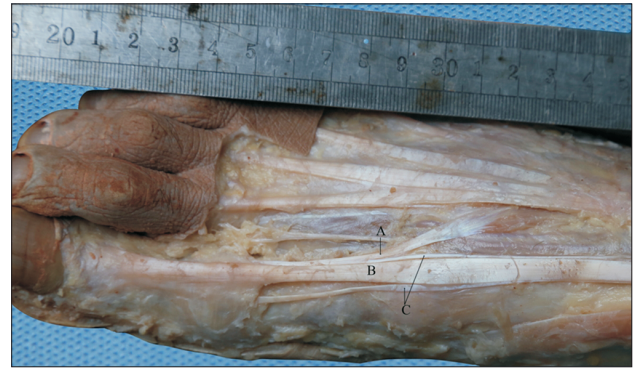
Fig. 3. Morphological structure of type III accessory tendon (AT) of the extensor hallucis longus (EHL). Two ATs run on the medial side and lateral side each. A: extensor hallucis brevis, B: EHL, C: AT of the EHL.

The existence and attachment of the ATEHL has been described in previous studies. In 1871, Macalister de-