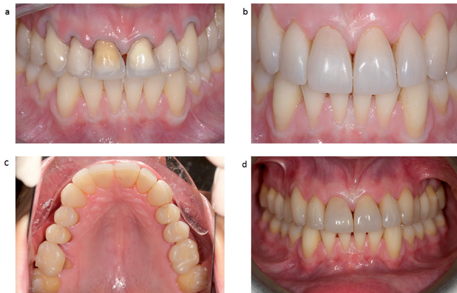
Fig. 3. a) Facial veneers preparation, performed immediately after the delivering of the six palatal veneers. b) Final result of the vestibular composite veneer restorations. Each maxillary anterior tooth was restored by means of two composite veneers (palatal and facial), (sandwich approach), to guarantee the maximum preservation of the existing tooth structure. c) Palatal aspect after 4 years of clinical function. d) Frontal view of the vestibular composite veneer restorations after 4 years of clinical function.

It is well documented that eating disorders have serious consequences on both the physical and emotional health (12). Bulimia nervosa has severe effects on the functionality of the patient's oral cavity due to self-induced vomiting, leading to severe tooth erosion from stomach acids. The conventional treatment of these patients would require the teeth to be rebuilt using crowns, overlays and root canal treatment. This would involve a great loss of healthy dental tissue as well as very high expense, which young patients can not always afford. The treatment strategy should be strictly related to the extent of the erosive lesions and, therefore, different therapeutic options are possible. Limited erosion can be treated by placement of direct composite resin restorations, as shown in this clinical report (13,14). Several authors obtained a high success rate in the medium term using the direct technique to reconstruct teeth that had been subjected to erosions or abrasions (7,13,14). Indeed, currently available resin composites are much improved from a mechanical viewpoint and, in addition,