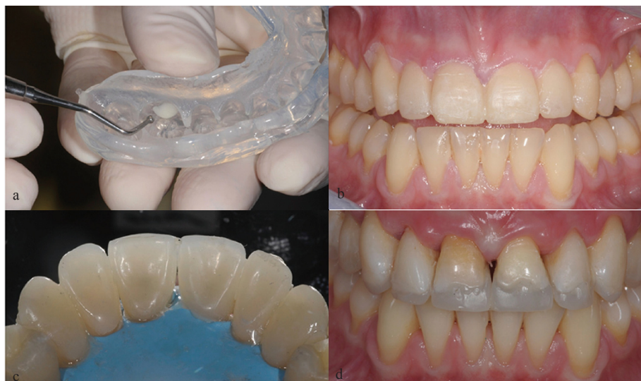
Fig. 2. a) Translucent silicone key loaded with composite to fabricate the posterior restorations. b) Positioning of the six maxillary anterior teeth in place to check if its aesthetic appearance was very pleasing for the patient. c) Occlusal view of the palatal composite veneers for the anterior maxillary teeth. No root canal retreatment was necessary for the two central incisors and the endodontic access was filled with composite before taking the final impression for the palatal veneers. d) Frontal view of the bonded palatal composite veneers for the six anterior teeth.