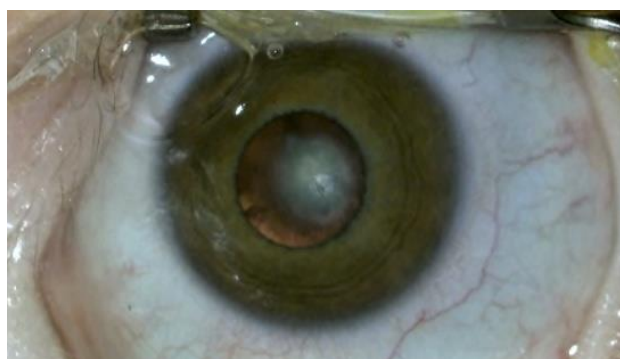
Fig. 1 Posterior polar congenital cataract in a patient with Down syndrome from our series

All 26 surgeries were performed by the same eye surgeon with pediatric cataract surgery experience. The surgical techniques were adapted to each case, depending on the