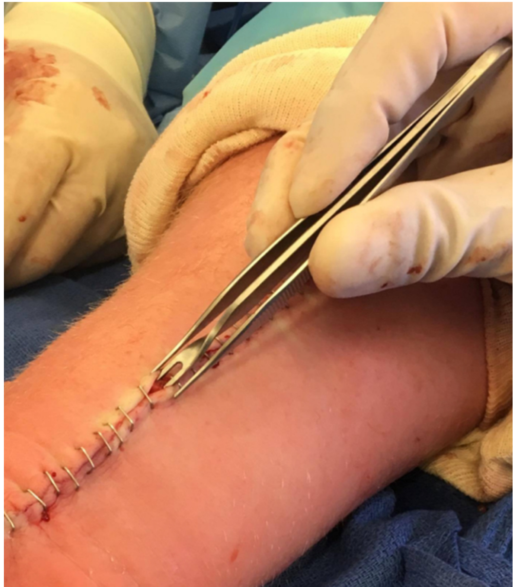
FIGURE 3: Insorb forceps: the use of an Insorb forceps (shown above) allows for wound eversion during stapling.

Insorb, Incisive Surgical, Plymouth, MN, US