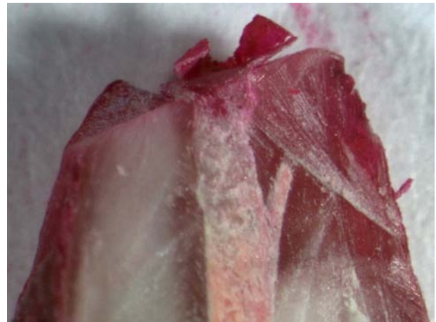
Figure 3. Minimal dye penetration into the Kryptonite bone cement when used as a retrograde filling material.