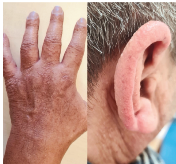
Figure 3. Clinical improvement after 6 months of therapy.