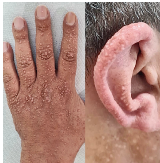
Figure 2. Smooth papules of left dorsal hand prior to the therapy.