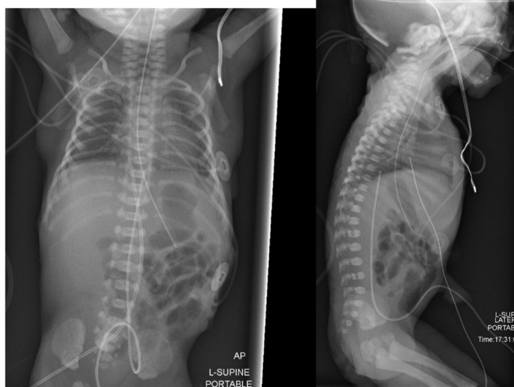
Fig. 1 Initial AP and lateral chest X-ray showing radiographic features of RDS

The procedure was performed by a neonatal physician trainee who was certified to perform LISA. The vocal