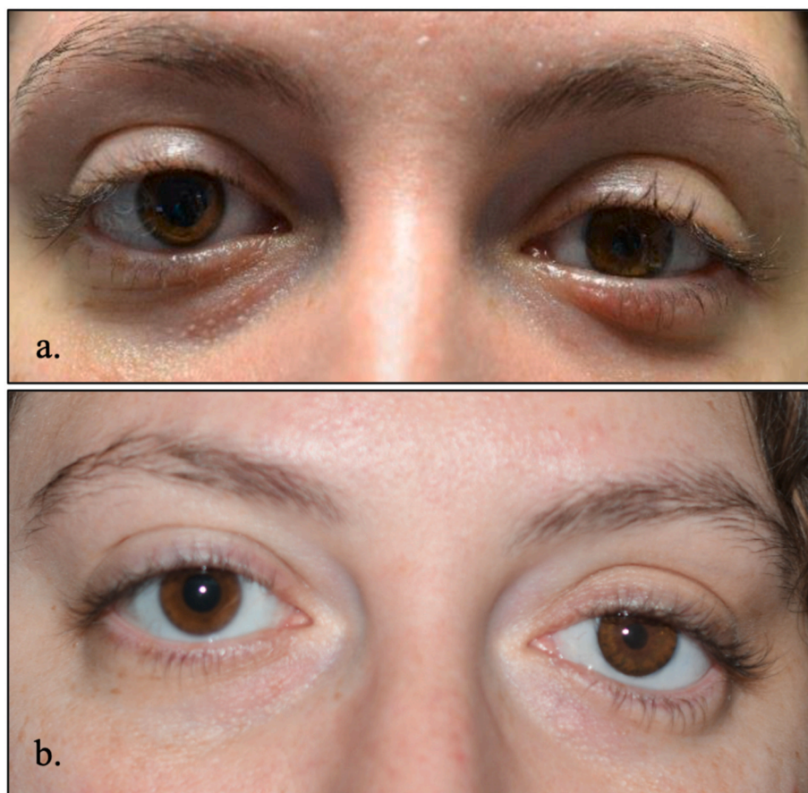
Fig. 2. Post-operative photographs of the same patient (a) at 1 month, showing improved left lower lid position, and (b) at 10 months, showing recurrence of lateral retraction of the left lower lid.

IRB approval was obtained (required for studies and series of 3 or more cases)-N/A.