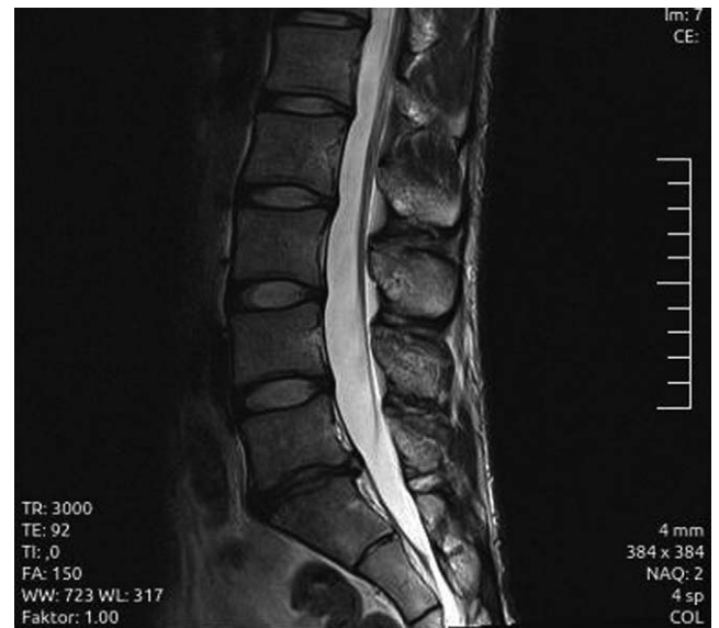
Figure 1. Sagittal T2-weighted MRI scan showing Pfirrmann grade 4 between L5-S1 and a disc protrusion at the same level without nerve compression.

Structured Interview. Each player was interviewed with a detailed questionnaire, including an assessment of career duration (number of years of high-level indoor or beach volleyball activity), the amount of weekly training duration (including games), episodes of LBP including neurological deficiency, as well as use of pain medication and conservative management such as physical therapy. Each player completed the Roland-Morris questionnaire, 12 Oswestry low back pain index 2.1, 13,15,25,39 and Short Form-36 (SF-36) questionnaire as well as a visual analog scale (VAS). The physical examination of the players was performed by 3 experienced orthopaedic surgeons who are trained in spine surgery (F.K., B.R., and H.F.).