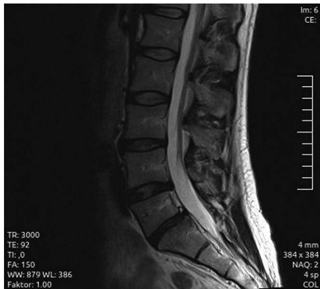
Figure 2. Sagittal T2-weighted MRI scan showing Pfirrmann grade 4 at levels L5-S1 and grade 3 at levels L3-4 and L4-5. Additionally, there is spondylolisthesis Meyerding grade 1 between L5 and S1.

reduced. Grade 5 includes a hypointense black signal intensity and collapsed disc space.