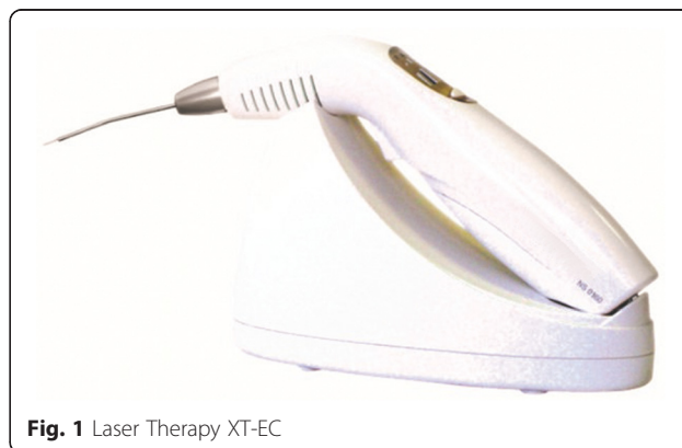
Fig. 1 Laser Therapy XT-EC

One session of PDT with the Chimiolux® methylene blue photosensitizer (Hypofarma, Belo Horizonte, MG, Brazil) at a concentration of 0.005 % will be performed in the interior of the root canal. The photosensitizer will be applied with a sterile paper cone for 3 minutes and the excess will be removed with an endodontic aspirator. The canal will be irradiated for 40 seconds, with the device previously calibrated to emit a wavelength at 660 nm, with radiant energy of 4 J and mean maximum power of 100 mW (Table 2). The direct contact method will be employed, based on a previous study [4, 7].