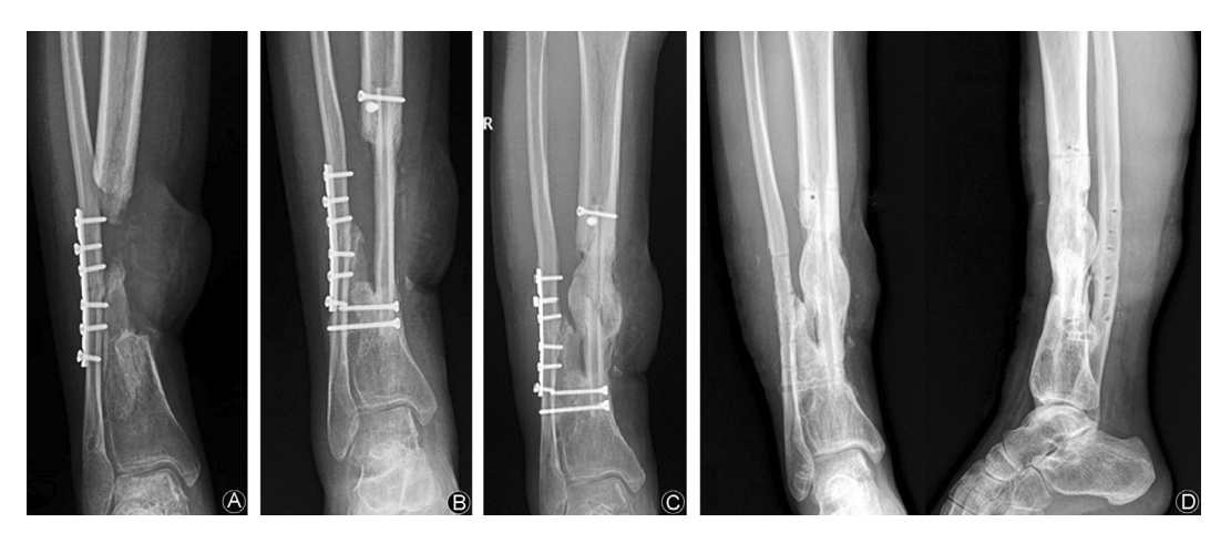
Fig. 1. Case 1. A: X-ray of tibial defect. B: X-ray shows bony healing of the grafted fibula six months postoperatively. C: A stress fracture was found 12 months postoperatively with a large bone callus. D: The grafted fibula became nearly as strong as the tibial shaft 66 months postoperatively.

hypertrophy. No special intervention was performed because the patient felt no pain at the time of visit. X-ray showed that the transferred fibular graft had become nearly as strong as the tibial shaft when the patient returned for check-up 66 months post-operatively (Fig. 1D). She could walk and jump normally without any pain.