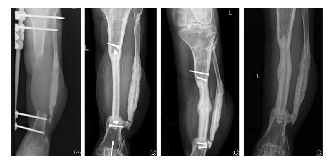
Fig. 2. Case 2. A: Large segmental tibial defects are present in the left leg following segmental resection for tibial osteomyelitis. B: X-ray shows no significant hypertrophy in the shaft of the fibula 24 months postoperatively. C A stress fracture occurred 26 months postoperatively. D: X-ray six years postoperatively showed that the stress fracture had healed and the hypertrophy was very significant.

A 44-year-old male sustained severe trauma to the right lower leg in December 2012. He developed severely comminuted open fractures of the tibia and fibula. The seriously contaminated tibial segment was removed (Fig. 3A). When no sign of infection was observed three months later, he underwent FVFG combined with a locking plate for tibial defect reconstruction. The postoperative rehabilitation protocol was identical to that for the other two patients. The grafted fibula experienced a smooth union, and function was excellent at the last follow-up (two years). No stress fractures