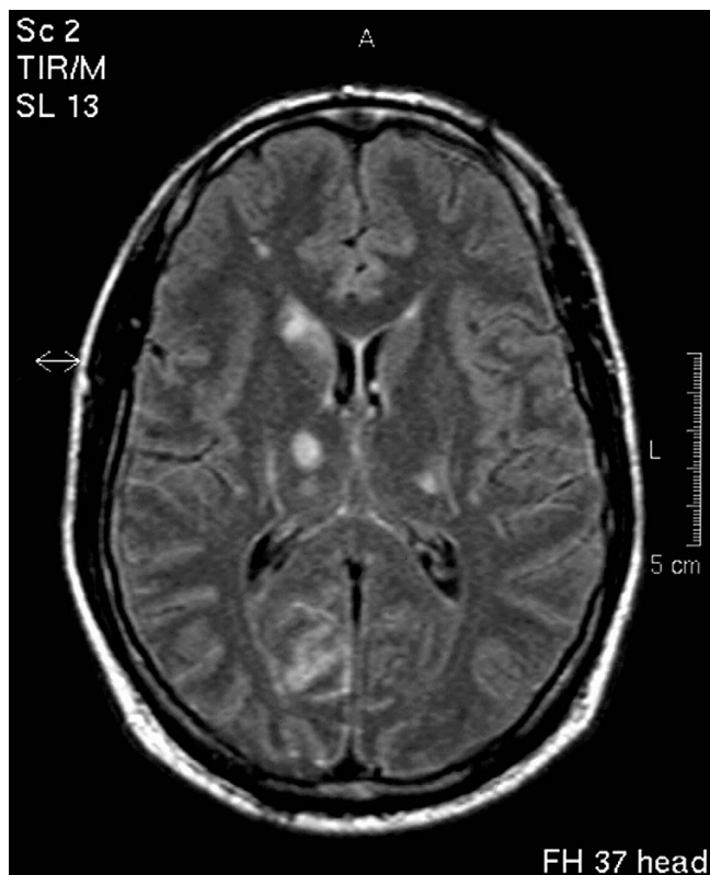
Figure 1 Cranial MRI (FLAIR) on the day of admission showing multiple lesions of the supratentorial grey and white matter.

laboratory examinations showed no abnormalities. Serum antibodies to neurotropic viruses, HIV, Treponema pallidum and Borrelia burgdorferi were not found. The cerebrospinal fluid (CSF) contained inflammatory cells (32 lymphocytes/ \mu l) and total CSF protein was elevated (930 mg/l). The glucose ratio was normal. Immunological studies and polymerase chain reactions for herpes simplex virus type 1, 2 and varicella-zoster virus were unobtrusive. Suspecting acute viral meningoencephalitis the patient was treated with aciclovir 3 \times 750 mg/d. Within 24 hours after acute onset of focal neurologic symptoms remission of dysarthria was observed while the abnormal sensation and mild agitation were still present. Magnetic resonance (MR) scans performed 24 hours after acute onset of focal symptoms showed disseminated hyperintensities of the supratentorial grey and white matter with predominance in the right occipital region lacking enhancement after GdDTPA-injection (Figure 1). The MR-angiography was normal. The characteristics and location of these findings were not typical for acute disseminated encephalomyelitis or herpes simplex encephalitis. The follow-up MR scans showed an increase of white matter hyperintensities with