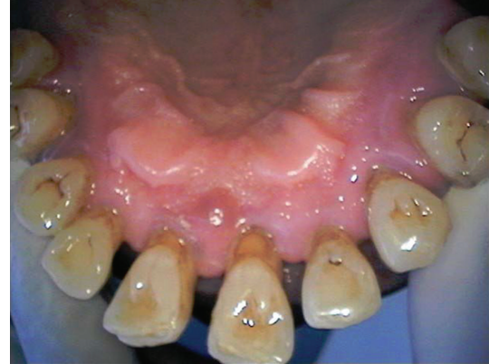
FIGURE 2: Periodontal disease.

mortality. Maternal infection such as periodontal disease can play a role in PTB, though this is still a controversial topic. Periodontal disease is divided into two categories; Gingivitis is a mild, reversible inflammation of the gingival tissues and Periodontal disease is a more severe and destructive irreversible form of the disease. 80% of American adults are affected with some form of periodontal disease [1].