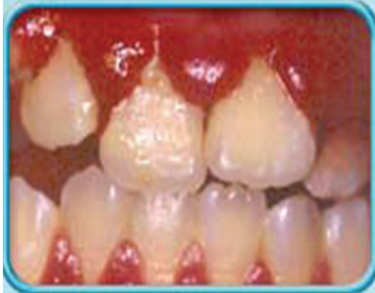
FIGURE 1: Pregnancy Gingivitis.