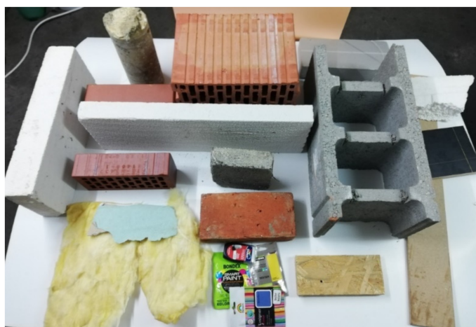
Figure 1. Examples of building materials used in the research.

The research material used for the measurements was typical building materials used in the construction of buildings in Poland. For the research, the 16 most often used building materials were selected, based on information obtained from architectural offices and companies supplying construction sites (Figure 1).