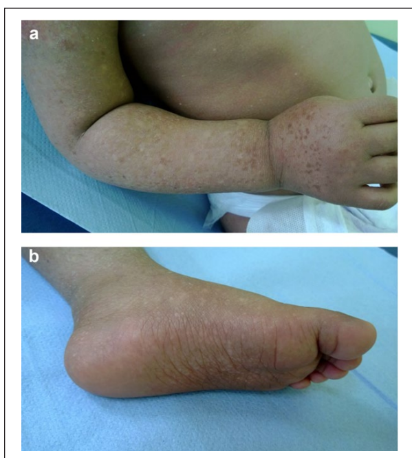
Figure 2. Poikilodermatous changes affecting (a) the upper limb and (b) lower limbs including the soles of the feet.

C16orf57), a gene located at 16q21 encoding for a protein that is crucial for U6snRNA (small nucleolar RNA) processing and stability. 7 U6snRNA has a vital role in RNA splicing and functions as a 3'-5' exoribonuclease that removes both adenosine and uridine residues from the 3'-end of U6 snRNA. 7 To date there have been 40 reported cases and 19 disease causing mutations. The variants reported in USB1 are predicted to be loss of function (splicing, nonsense, or frame shift). 8 The current patient has been reported by Walne et al in a recent case series that describes whole exome and direct Sanger sequencing used to identify