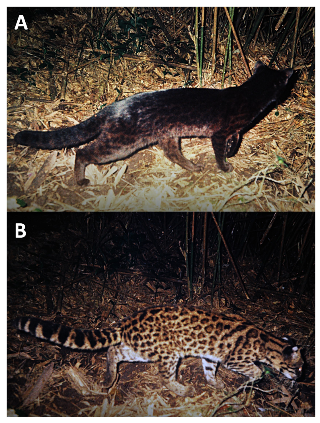
Fig 1. Camera-trap photographs of Southern tigrinas. (A) A melanistic individual without white ear marks; (B) A non-melanistic individual showing the white marks on the posterior surface of the ears.

https://doi.org/10.1371/journal.pone.0226136.g001