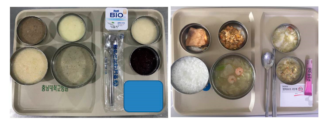
Figure 2. Soft diet for dysphagia patients. ( a ) The dysphagia level 1 diet consisted of a puréed diet. ( b ) The dysphagia level 2 diet had an increased viscousity than that of level 1. Both diets were ground food based on the traditional Korean diet.

Liquid diet via tube feeding, dysphagia diet level 1, dysphagia diet level 2, and regular diet was supplied to patients according to their dysphagia level. We applied 0 points to liquid diet, 1 point to dysphagia level 1, 2 points to dysphagia level 2, and 3 points to regular diet. Dysphagia level 1 diet consisted of a puréed diet. The ground food provided to patients was based on a traditional Korean diet. The dysphagia level 2 diet had an increased food viscosity compared to the level 1 diet (Figure 2). A thickener was added to the traditional Korean soup "gook" to prevent aspiration, because it has a higher water content compared to western soups.