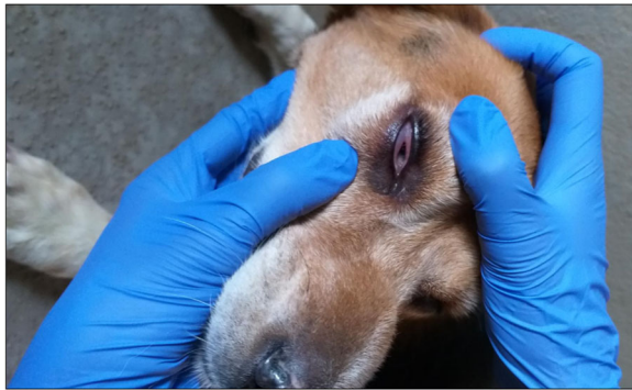
Fig. 2 Redness and conjunctival edema of the right eye of dog exposed to Aedes mosquitoes

proteins in the saliva of the mosquito were injected into the skin by the feeding mosquitoes. This high dose of allergen received by the dog during the single hour of exposure may be the trigger factor allowing the dog's immune system to quickly produce high levels of IgE. Hence, the plasmatic IgE threshold may have been reached during the one week preceding the second challenge. In most cases, the immune system regulates itself so that more IgG than IgE is produced, meaning no hypersensitivity appears [3]. Genetic factors are essential for the levels of circulating IgE [3], and may explain why the remaining dogs living in the same environmental conditions and subjected to the same experimental situations did not show any sign of hypersensitivity ( n = 27 ).