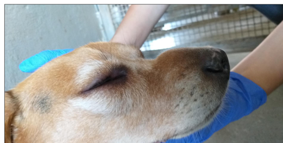
Fig. 1 Swelling on the face including the muzzle and around the eyes of dog exposed to Aedes mosquitoes

Though only nine mosquitoes had successfully taken a blood meal from the dog during the Day 1 challenge, this number was enough to trigger an acute allergic reaction. Apparently, the dog was strongly sensitized to mosquito bites during the first massive exposure (46 fully engorged mosquitoes were collected at the end the exposure), during which anticoagulants and other