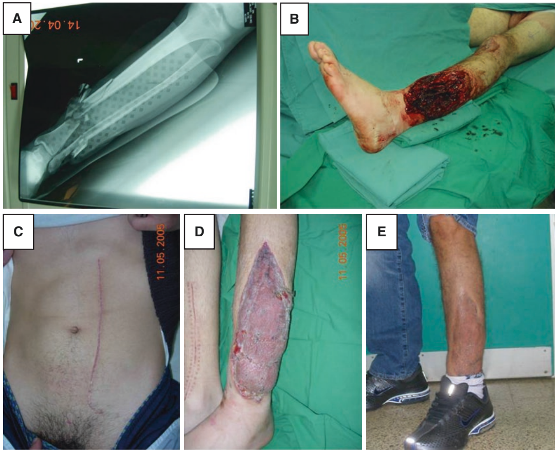
Fig. 14.4 The process of soft tissue coverage with a free vascular graft after a Gustilo 3B open tibial fracture due to gunshot injury. A. Initial Ex-ray of the fracture. B. The extent of the soft tissue injury over the fracture site. C. Abdominal scar after harvesting the Rectus Abdominis

free vascular graft. D. One month post op – the graft is fully imbedded with no rejection. E. 1 year post op – the patient regained full functionality