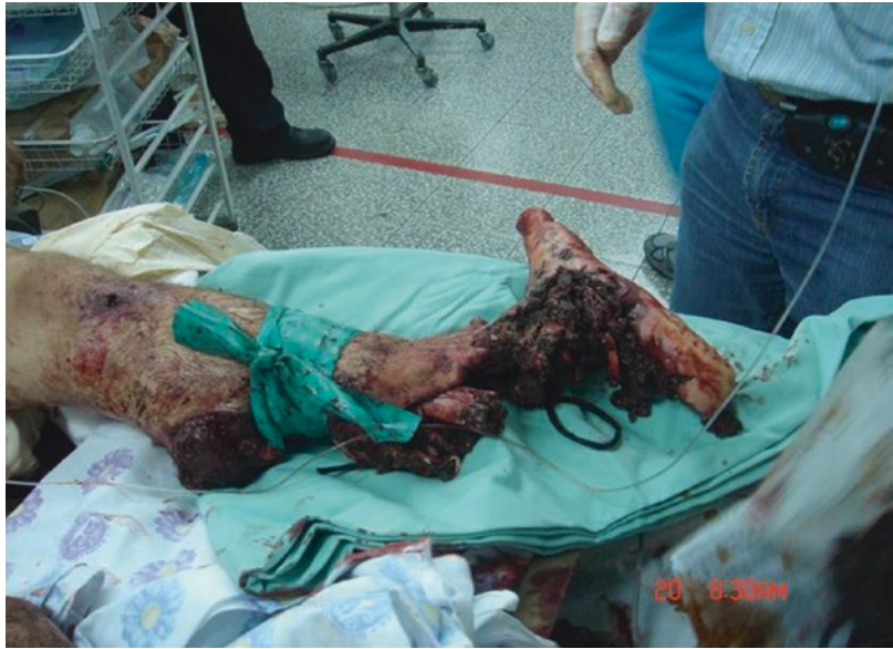
Fig. 14.2 Acute traumatic amputation due to an explosive device. Notice the fracture through the shaft and the massive damage to the soft tissue

demonstrated significant differences in the ISS scores, the complexity of the injuries, the need for operative treatment, the number of ICU admission days, and, of course, mortality rates – all of which were higher in the terror-related trauma group [23–28].