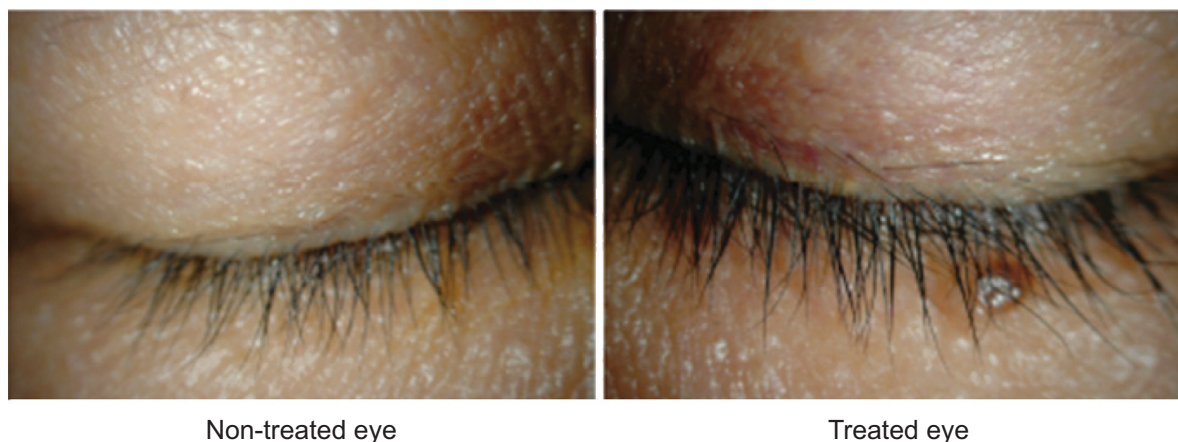
Figure 2 Eyelash lengthening/bristling with bimatoprost administration.

Conjunctival hyperemia was evaluated and graded in eyes in which latanoprost was currently being used. Medication