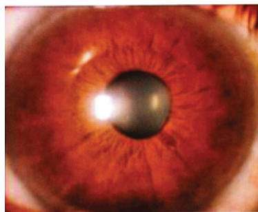
Figure 4 Iris pigmentation before and 6 months after latanoprost therapy.

Note: Reprinted with permission from Inoue K, Wakakura M, Inoue J, et al. [Adverse reaction after use of latanoprost in Japanese glaucoma patients]. Nihon Ganka Gakkai Zasshi . 2006;110(8):581–587. 20 Copyright © 2006 Japanese Ophthalmological Society.