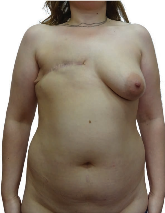
Fig. 1. Patient on admission.