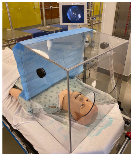
Figure 1 Use of the aerosol containment device for a simulated intubation procedure.

In response to the need to further protect our healthcare providers, we collaborated with HYL to adapt the design of his 'aerosol box,' a clear plastic barrier device to shield clinicians from aerosolised particles during airway procedures. 4 Hospitals around the world have begun manufacturing these