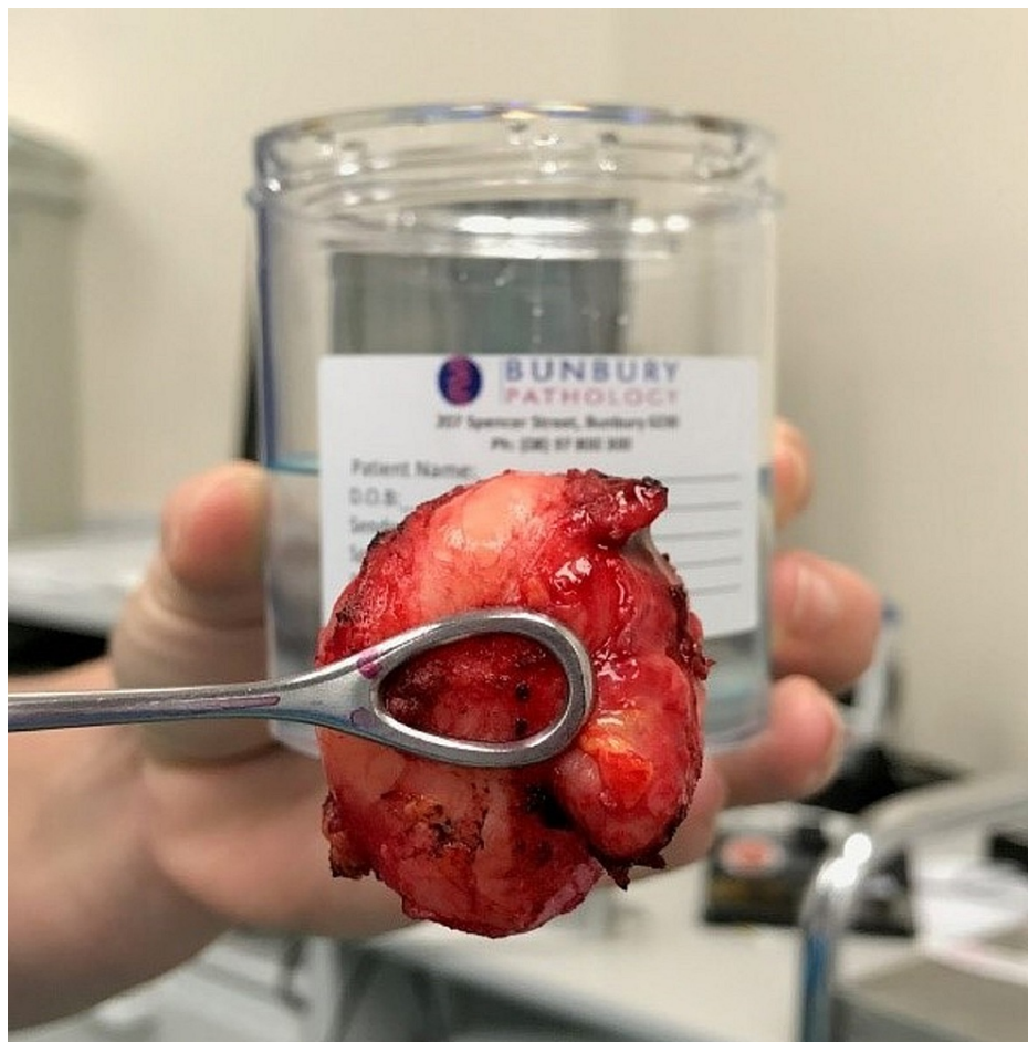
FIGURE 4: Mass excised and sent for histopathology. The mass was later identified as a benign angioleiomyoma.