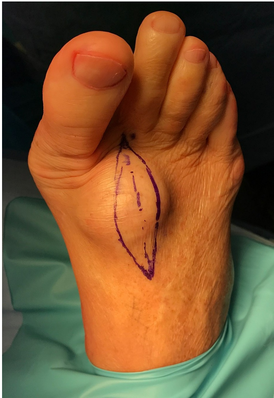
FIGURE 1: Soft tissue mass on the patient's right dorsum foot within the first intermetatarsal space.

The patient reported ongoing irritation and limitations in footwear, with concurrent paraesthesia in the first web space. He was concerned about the progressive growth of the lesion within recent years. He recalled nil previous trauma or foot and ankle surgery. On examination, the large soft tissue tumor was dome-shaped, immobile, and solid. Direct palpation elicited mild pain and recreated his paraesthesia in the first web space which identified involvement of the deep peroneal nerve.