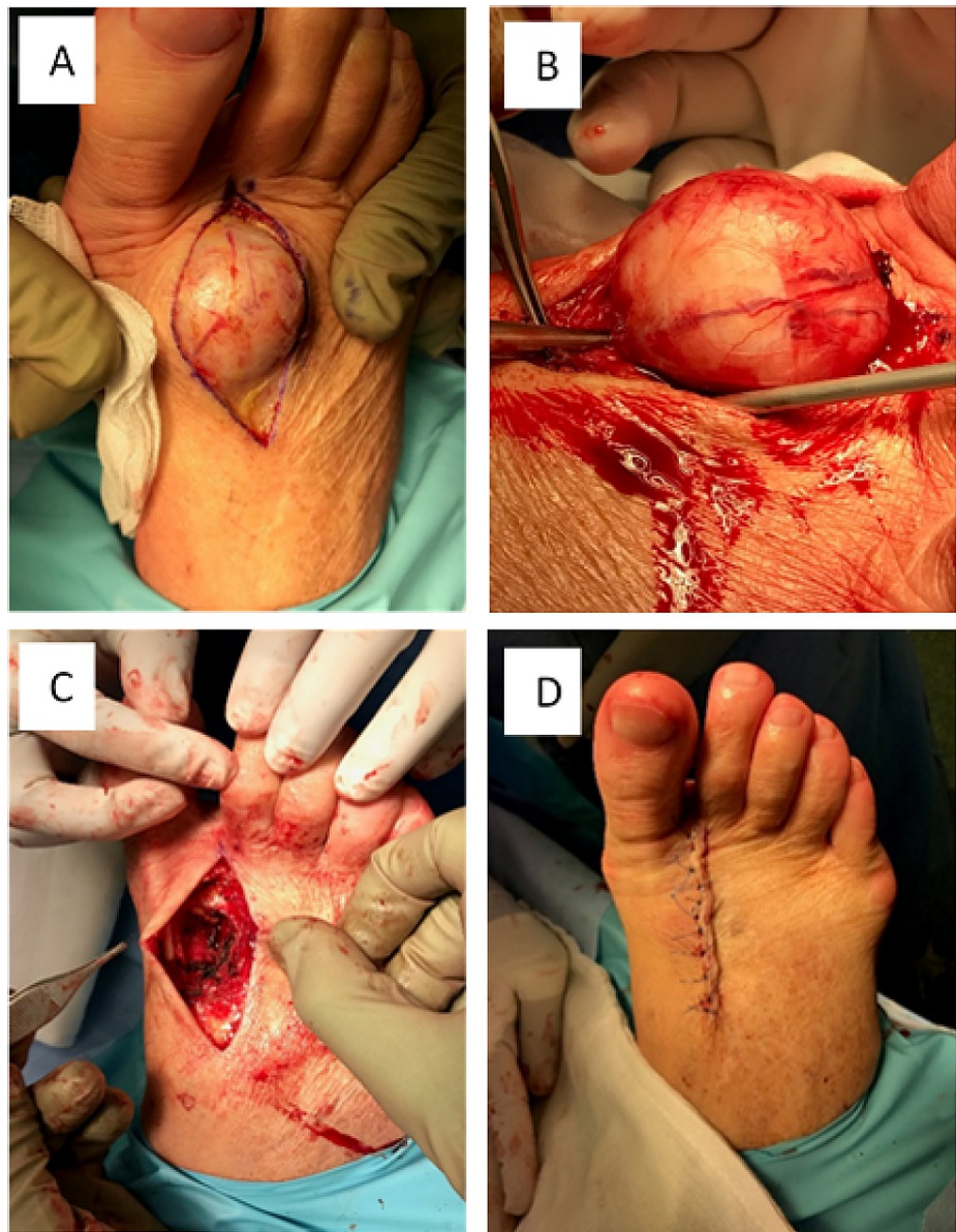
FIGURE 3: Surgical approach for excision of the mass. Intraoperative visualisation of the well-encapsulated large benign tumor.

The large mass (46 × 36 × 30 mm) was sent for histopathology, where the sections demonstrated a circumscribed bland spindle cell proliferation with low cellularity (Figure 4). The proliferating cells were composed of spindle cells in bundles and fascicles, elongated nuclei which had rounded ends, and fibrillar stroma. The section was admixed with ectatic blood vessels which were lined by regular endothelial cells. The histopathology findings were consistent with a postoperative diagnosis of a benign angioleiomyoma. Postoperative healing was uncomplicated and there were nil symptoms or evidence of regrowth at 12 months review.