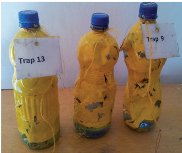
Fig. 1. Locally made fruit flies traps (donated by Arba Minch Plant Health Clinic).