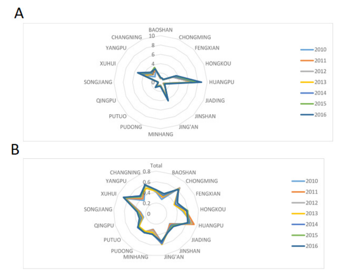
Figure 1 Per 1000 doctors in health institutions across the districts from 2010 to 2016. (A) Per 1000 doctors in hospitals across the districts from 2010 to 2016. (B) Per 1000 doctors in PHCs across the districts from 2010 to 2016. PHC, primary health centre.

.GR, growth rate; PHC, primary health centre.